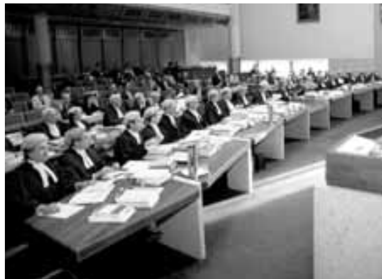
1996 Cape York Aborigines & Thayorre v Queensland land case opened in Canberra 11 June 1996.

In the general area of rights and freedoms, however, Deane and Toohey JJ went beyond the methods employed by the rest of the court. They expounded doctrines which had less connexion with the text of the Constitution and which would have opened up a vast area of judicial power in respect of the formulation of entrenched individual rights. They put forward the principle that