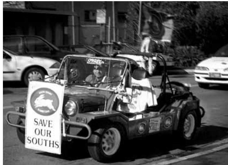
South Sydney Rabbitohs celebrate appeal court victory at South Sydney Leagues club.

competition other than the 14 clubs (including merged clubs as a single club) who would be selected to participate in the NRL competition from the year 2000.'