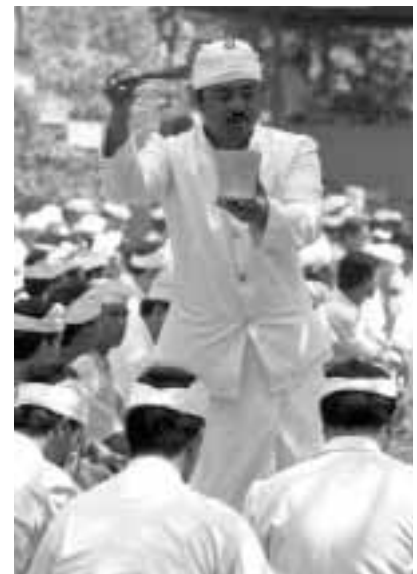
Memorial ceremony in Bali.

strength to remember that the unearned suffering of the many victims in Bali can and will be redemptive. In that process lawyers have a role and responsibility to discharge. We must address the problems and the injustices of our region. There are practical activities in which Australian lawyers can involve themselves in refugee and asylum seeker issues, to continue to expose the blight of mandatory detention in immigration, to assess critically Australia's laws introduced to deal with anti-terrorism, participate in AusAid projects and give up time to work