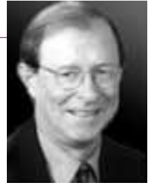
Hon Daryl Williams AM QC MP