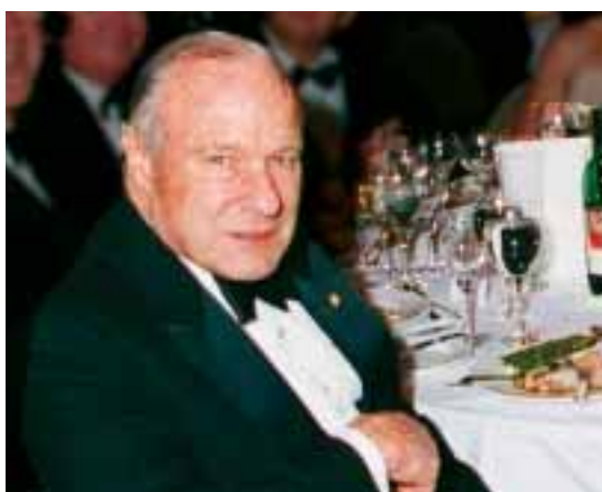
Sir Laurence Street AC KCMG KStJ