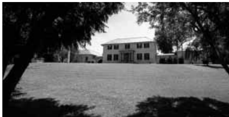
Old Government House in Parramatta Park.

So it's comfy - but is there enough work to go around? The state government's drive for so-called 'tort law reform' in personal injury, medical indemnity and workers compensation litigation seems to have washed over the Parramatta Bar with little effect. To the best of their knowledge, those we spoke to could think of only one barrister who practised solely in workers compensation and personal injury.