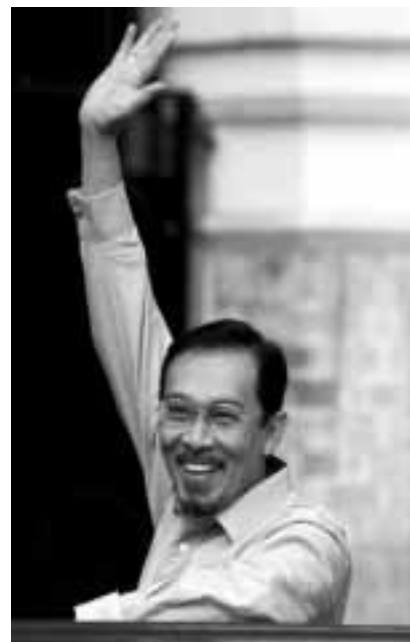
'I don't think Anwar Ibrahim should be written off, never.'

He said: "Can you do something about it?" I said first things first, I think we have got to get you to the hospital, and I'll make the application in the morning. Which I did the next morning and in the course of his submission, what I said was this - it could well