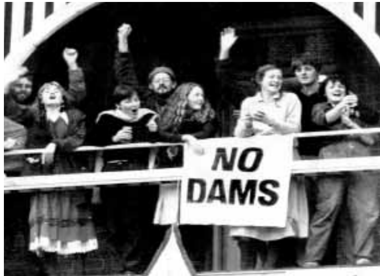
Members of the Tasmanian Wilderness Society celebrate the High Court decision to prevent a dam being built on the Gordon-below-Franklin river. July 1983.

The issue in the first case was thus which of two competing values or policies should prevail: federalism or representative government? 22