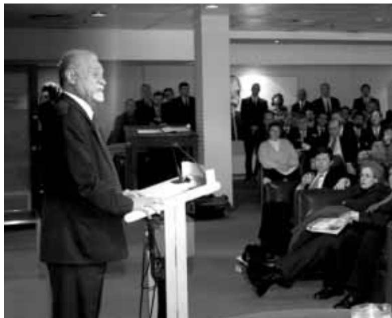
The NSW Bar Association: 25 July 2002.

Karpal Singh: The events of 1988 related to the assault on the judiciary by the executive, leading to the removal of the head of the judiciary Tun Salleh Abas and two senior Federal Court judges. It showed the might of the government. The Constitution provides for the prime minister to initiate proceedings to remove judges with the setting up of a tribunal for the purpose. Clearly, this impinges on the doctrine of separation of powers and the