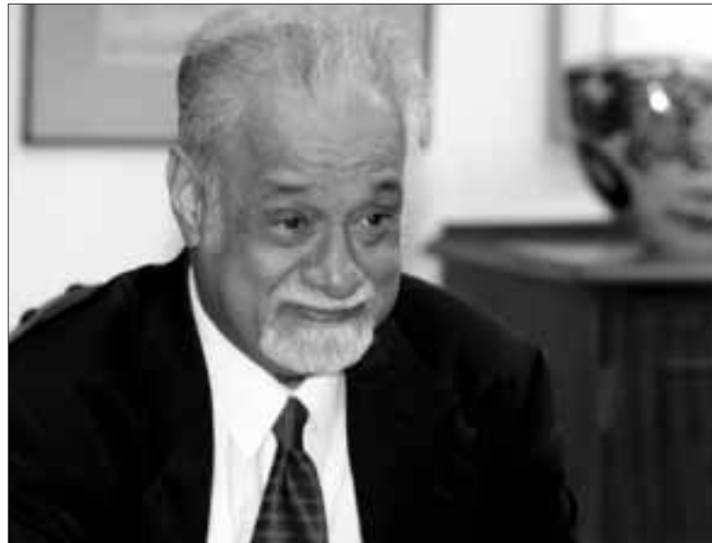
My father actually wanted me to be a doctor.

Karpal Singh: Yes. I had some lucky breaks in the beginning. I started off in a very small town called Alor Star, which is about 60 miles from Penang. One of the reasons for that was I couldn't get a job in Penang, and somehow I ended up there