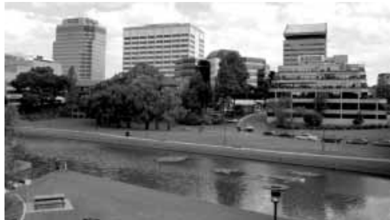
Parramatta city by the river.

Family law is the mainstay of the Parramatta Bar, followed by criminal law and personal injury litigation. In contrast to Phillip Street and the Sydney CBD, the Parramatta barristers report that their respective practices tend not to involve any substantial amount of equity work. Perhaps as compensation for this, they enjoy instead practices featuring a number of comparatively interesting and worthwhile jurisdictions such as RSPCA and other animal protection work, child protection matters, mental health advocacy and Defence Act cases.