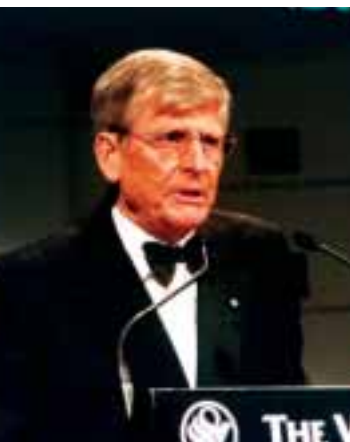
Chief Justice Gleeson AC