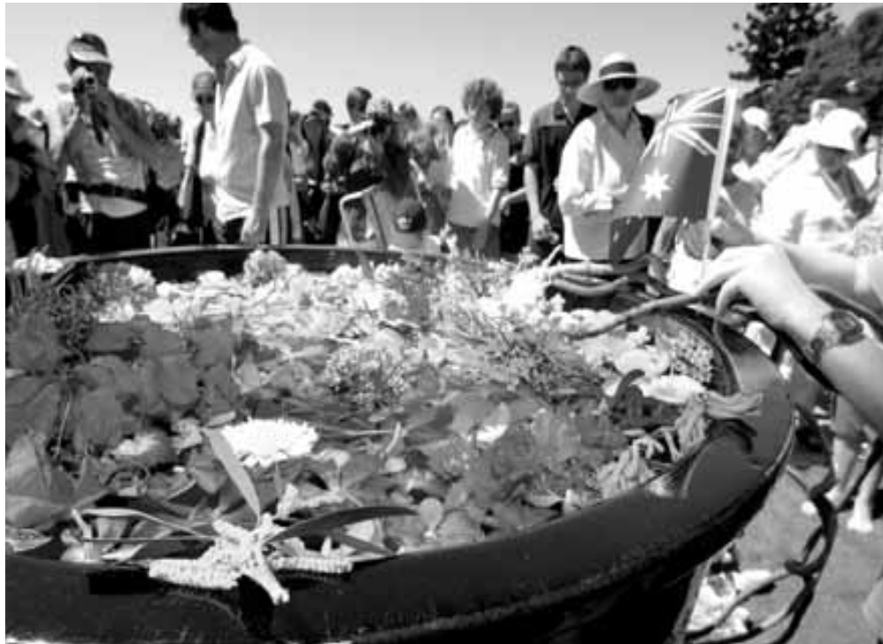
Flowers placed on memorial pond at the Domain, Sydney.

The bomb blast in Bali is evidence that Indonesia's constitutional structure based on a secular state is at risk.