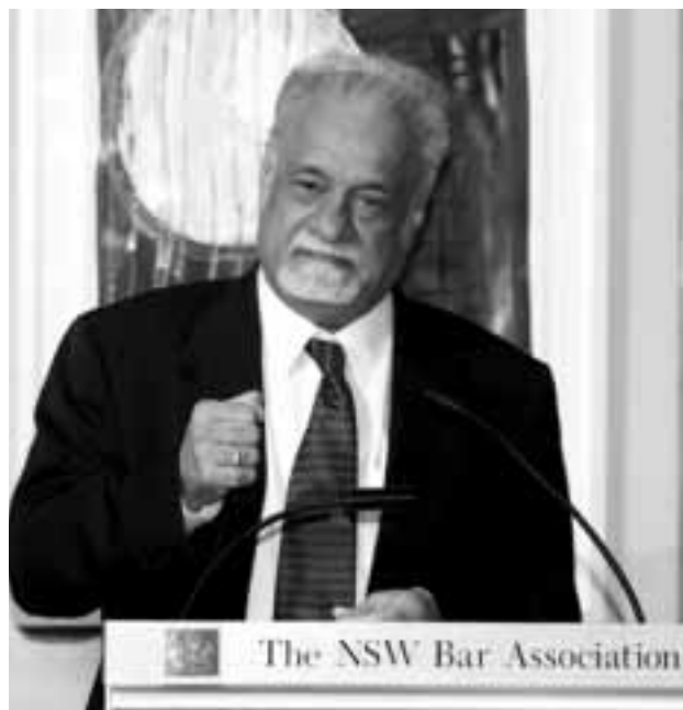
A forceful speaker

I took the case to the High Court and the Federal Court but