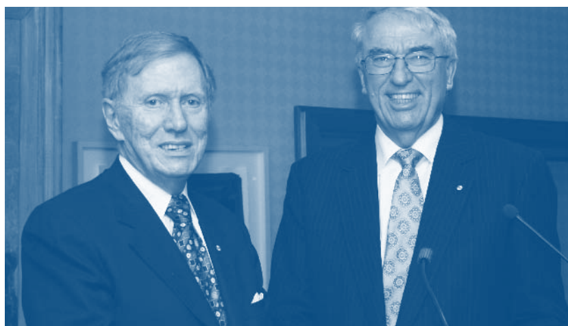
The Hon Justice M D Kirby AC CMG and the Hon Michael McHugh AC QC at the conclusion of a lecture in the Rhetoric Series.

Prior to the election, in its Criminal Justice Policy, the Bar Association protested at government plans to cut the Office of the Director of Public Prosecutions budget by approximately $3.4 million, arguing that such a reduction was irrational when police and corrective services budgets were being protected and