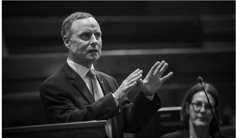
Lieutenant General David Morrison AO (rtd) speaking at 'Tipping the Scales'.

In preparation for the new regime, the committee undertook a full review of costs precedents and the costs and billing pages on the Bar Association's website.