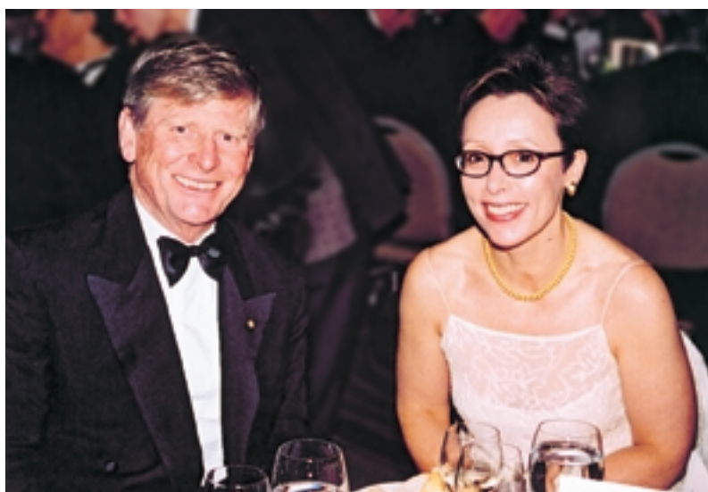
The Hon. Justice AM Gleeson AC and Ruth McColl S.C.