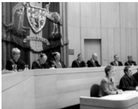
The Federal Court at the swearing in of The Hon. Justice James Allsop.

Your Honour has taken the old description of equity as a whispering jurisdiction to new lows. The hard of hearing have learnt to take their work elsewhere. Secondly, your Honour has a love of dim lighting. A number of theories have been offered for this predilection, most of which can be rejected out of hand. It's unlikely to flow from a desire to conserve energy. It's certainly not from a desire to reduce your electricity bills. Bankrupt and insolvent barristers do not practise at Dame Joan Sutherland Chambers. The most likely theory is that the dim lighting is to prevent those who