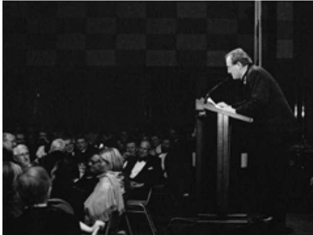
'I can have the privilege of defending six impossible propositions before breakfast.'

Speaking as the Attorney General, I can say that it is my role to preserve and protect such pains in the neck so that they increase, multiply and thrive into the future. For all our sakes.