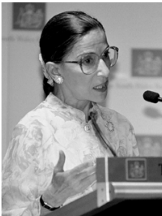
Justice Ruth Bader Ginsburg

Her Honour also said that on occasions 'when the court wants to know more about the importance of a case to the sound development of