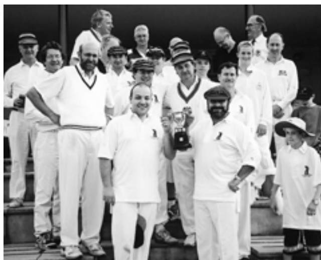
11 Wentworth/Selborne take the Lady Bradman Cup.