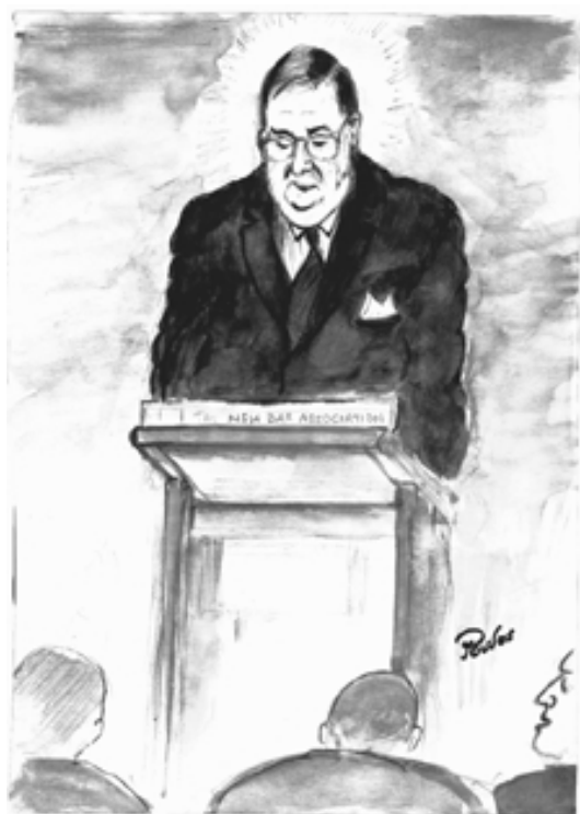
Justice Callinan.

The seminar, presented as part of the Continuing Legal Education Programme, will be published in the forthcoming edition of Australian Bar Review .