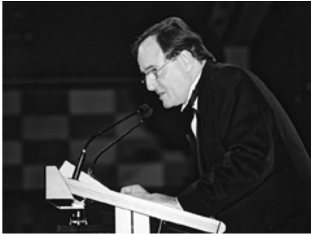
The Hon. Bob Debus MP:

By 8.00 or 8.30 in the morning, members of the public will have flooded ministerial offices with faxes, telephone messages and, particularly, e-mails, expressing their views, based on what they have learnt of the case from early morning radio.