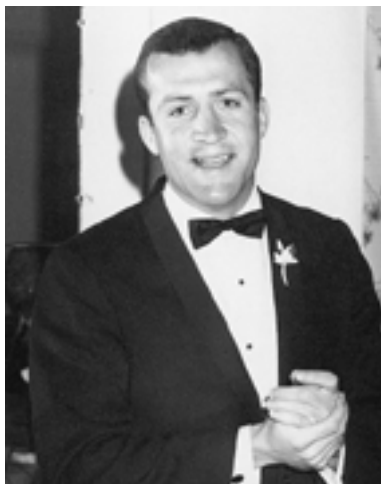
'Not a problem.'